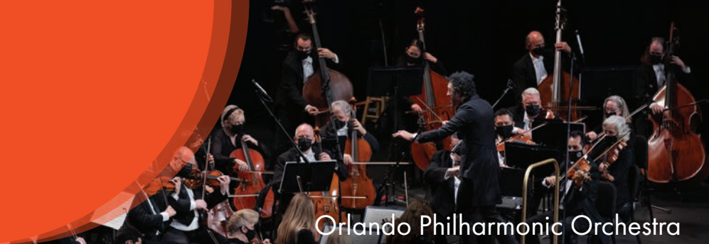
Orlando Philharmonic Orchestra