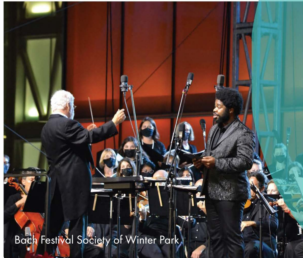
Bach Festival Society of Winter Park

Baker Barrios Architects; Busch and Company; Orlando Philharmonic Orchestra; Orlando Repertory Theatre; Silver Bullet Tech Pros LLC; Watermark Publishing Group Inc.