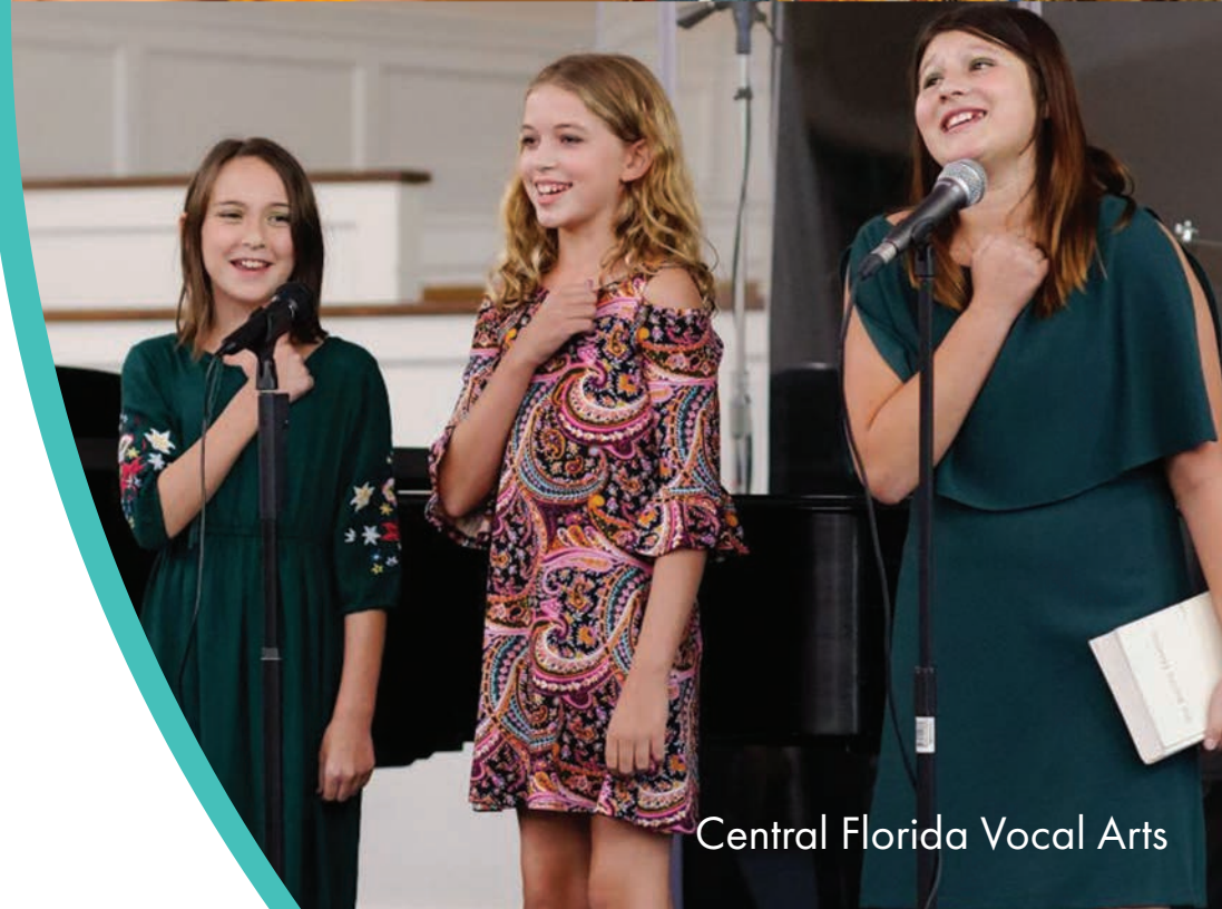
Central Florida Vocal Arts